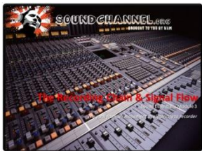
Recording Chain/Signal Flow