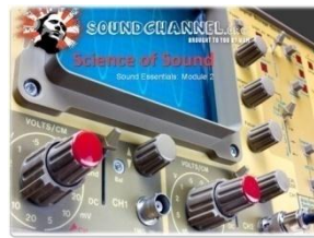
Science of Sound