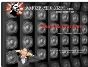
Sound & Your Ears